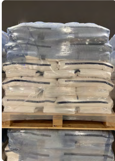
Palletised 25 kg small bags for container shipment