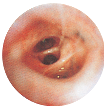
Previous Model BF-MP160F