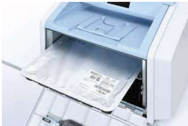
SD-S Film Cartridge

SD-S is specially designed for the Laser Imager DRYPRO SIGMA.