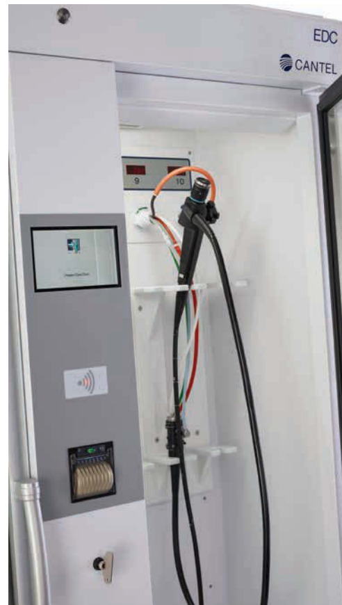
Ease of endoscope placement