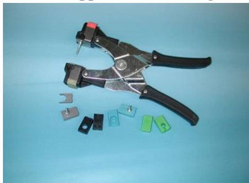
Universal applicator for ear tags MultiFlex

"TECHNICAL REQUIREMENTS are compulsory conditions for the Bidder and are included in the evaluation criteria of the Bidding.