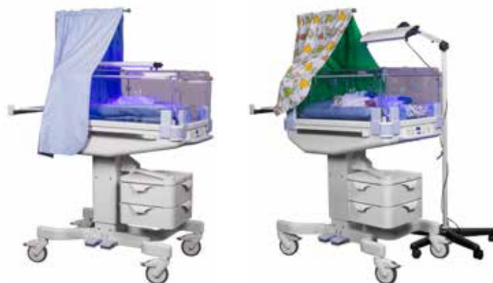
Sample applications with Lifetherm warming bed