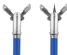
Jaw Ø 2.3 mm, 230 cm length