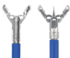
Jaw Ø 2.3 mm, 230 cm length