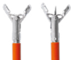
Jaw Ø 2.3 mm, 180 cm length