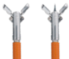
Jaw Ø 2.3 mm, 180 cm length