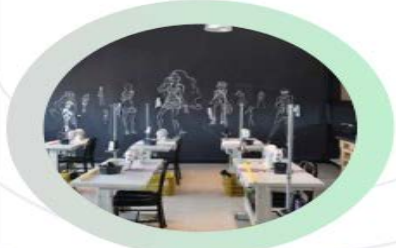
Well Trained Team