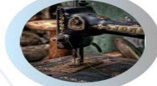
Years of Experience