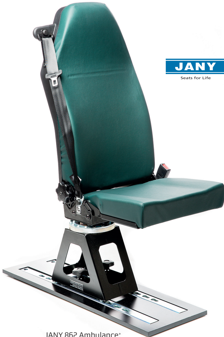
JANY 862 Ambulance +