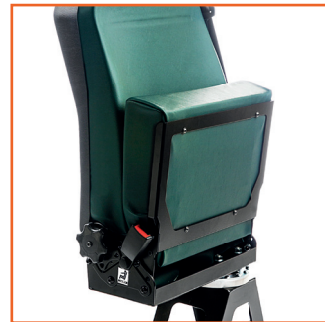
450 mm wide folded seat

Seamless upholstery is specifically designed for the ambulance market (EN 1789), where bacterial control and cleaning is particularly important. Therefore, the seat is made with antibacterial upholstery and fewer seams to prevent the build-up of bacteria.