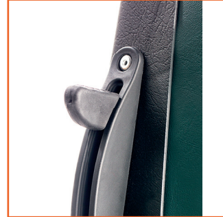
New release mechanism for the swivel