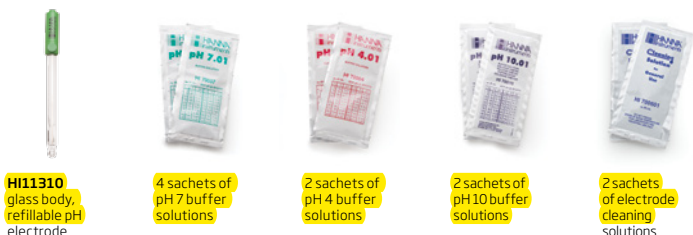
HI11310 glass body, refillable pH electrode

edge®pH: HI2002-01 (115V) and HI2002-02 (230V) also includes: