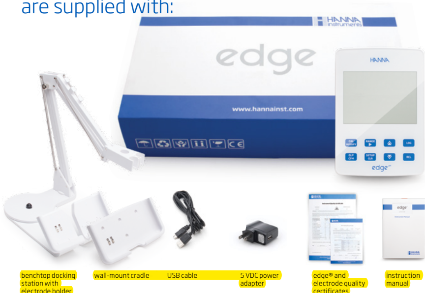
benchtop docking station with electrode holder

All edge® single parameter meters are supplied with: