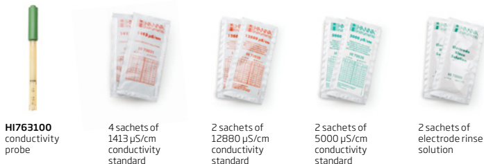
HI763100 conductivity probe

edge®EC: HI2003-01 (115V) and HI2003-02 (230V) also includes: