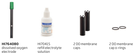
HI764080 dissolved oxygen electrode

edge®DO: HI2004-01 (115V) and HI2004-02 (230V) also includes: