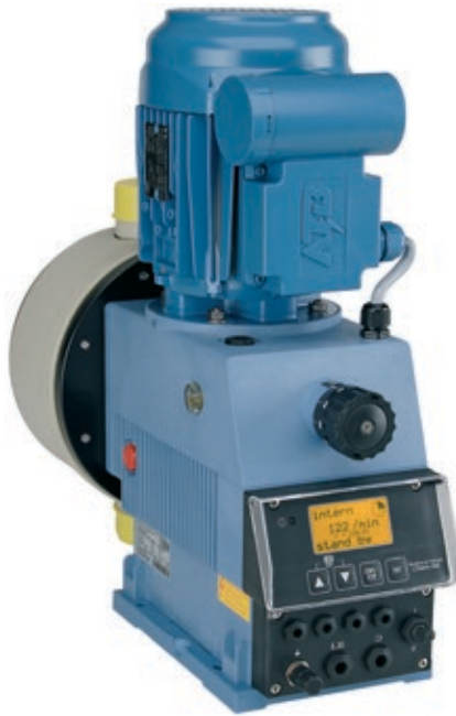
Chem-Ad® Series C