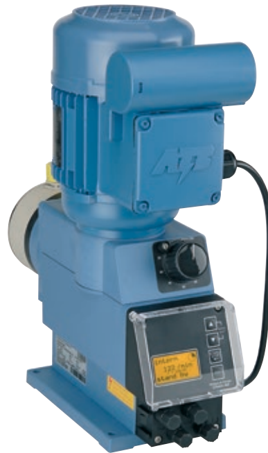
Chem-Ad® Series D