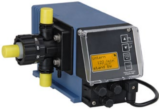
Chem-Ad® Series A