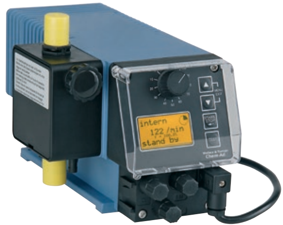
Chem-Ad® Series B