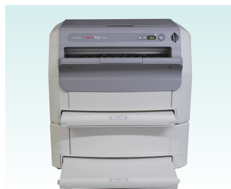
DRYPIX Lite shown optional sheet feeder unit and 2magazines

Specifications are subject to change without notice. All brand names or trademarks are the property of their respective owners. In some countries, regulatory approval may be required to import medical devices. For the availability of these products, please contact your local sales representatives.