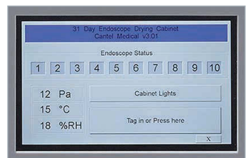
Large touchscreen for endoscope cycles at a glance