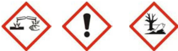
GHS 05 GHS 07 GHS 09