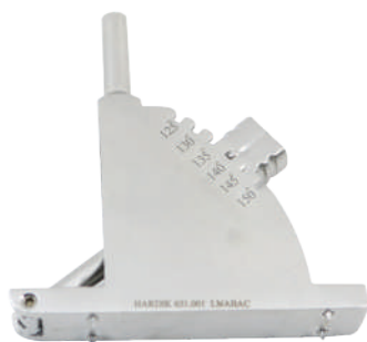
• 651.001 | DHS Angled Guide Adjustable 125° to 150°