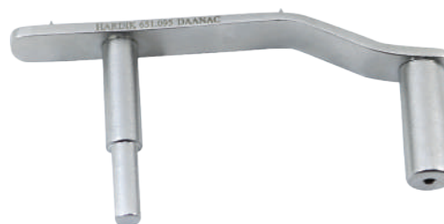
• 651.095 | DCS 95° Angled Guide