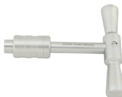
• 651.002 | T-Handle with Quick Coupling for DHS/DCS