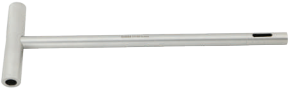
• 651.008 | DHS/DCS Wrench