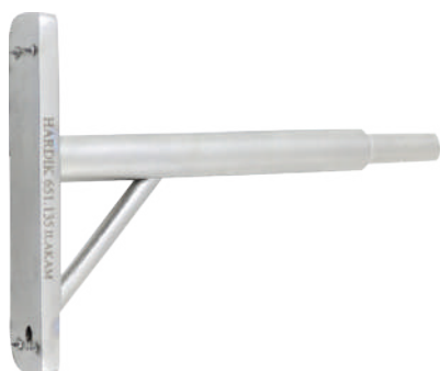
• 651.135 | DHS Angled Guide Fixed 135°