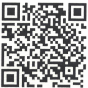
Scan for certificate status

The granting of this certificate does not mean that the certificate holder can avoid any legal obligation. If the products or activities covered in the scope of certification require administrative license, the certificate shall be only valid within the scope of administrative licensing. The registered organization shall be subject to regular annual supervision by GIC, and the continual validity of the certificate is base upon conformity of audit. Please scan two-dimension code at lift to find the certificate information. This certificate can be queried at the National Certification and Accreditation Commission official website ( www.cnca.gov.cn ) & GIC website ( www.gicg.com.cn )