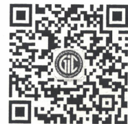
GIC WeChat public number

The granting of this certificate does not mean that the certificate holder can avoid any legal obligation. If the products or activities covered in the scope of certification require administrative license, the certificate shall be only valid within the scope of administrative licensing. The registered organization shall be subject to regular annual supervision by GIC, and the continual validity of the certificate is base upon conformity of audit. Please scan two-dimension code at lift to find the certificate information. This certificate can be queried at the National Certification and Accreditation Commission official website ( www.cnca.gov.cn ) & GIC website ( www.gicg.com.cn )