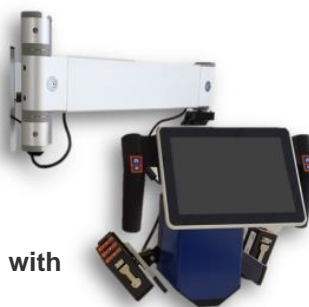
wall-mounted with a camera arm (part of EVIscreen )