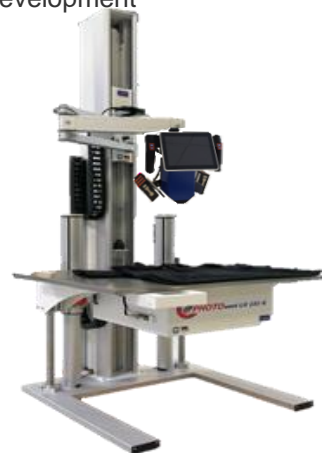
mounted on a full EVIscreen system