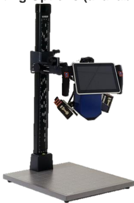
mounted on a standard camera stand