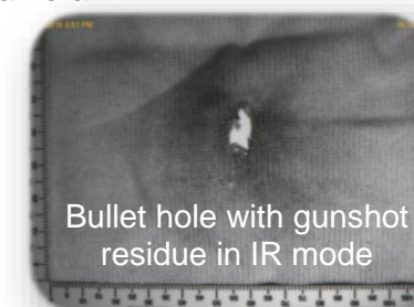
Bullet hole with gunshot residue in IR mode