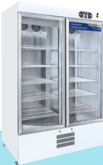
EKT 1450 (2°C/8°C)