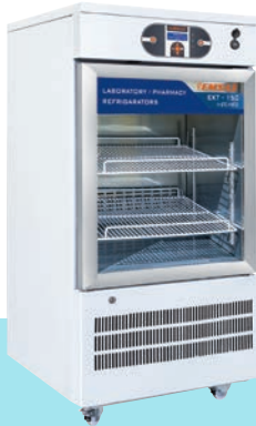
EKT 150 (2°C/8°C)