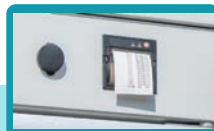
Optional Thermal Printer