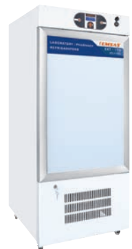
OPTIONAL BLOCK DOOR