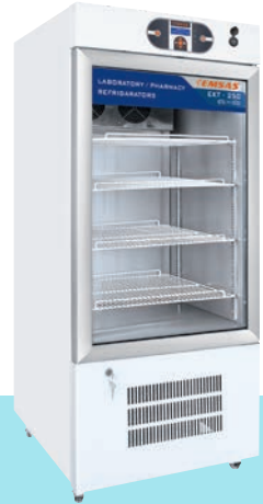
EKT 250 (2°C/8°C)