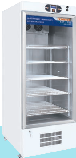
EKT 725 (2°C/8°C)