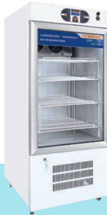
EKT 175 (2°C/8°C)