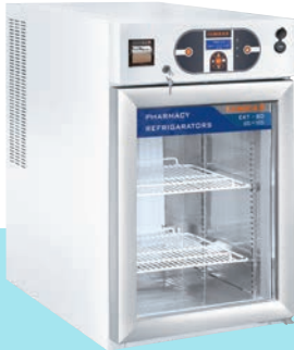
EKT 80 (2°C/8°C)