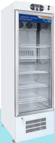
EKT 425 (2°C/8°C)