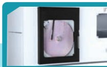
Optional Circular Printer