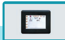
Optional Touch Screen