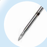
Pos. 0: Initial position