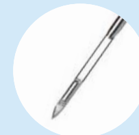
Pos. 1: for 10mm sample