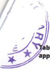
Table 2: Devices covered by this letter and for which the NB is NOT responsible for appropriate surveillance of the corresponding devices under the applicable Directive: