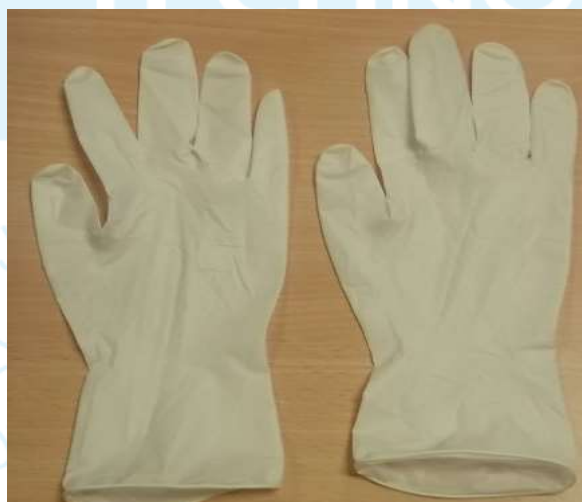
Powder Free Latex gloves non-sterile (PF NR)