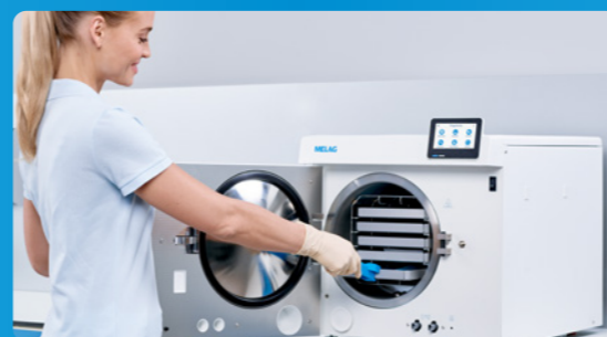
✓ Steam sterilization with Vacuclave