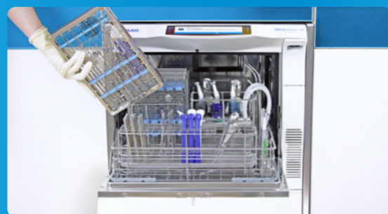
✓ Cleaning & disinfection with MELAttherm

Unique as a product, unbeatable in a system: