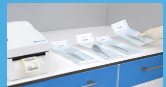
✓ Marking with MELAprint 80