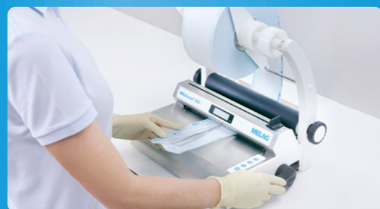
✓ Packaging with MELAseal or MELAstora