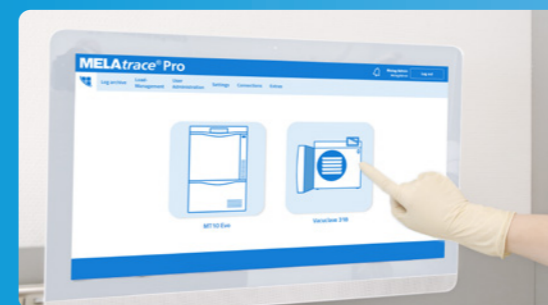
✓ Documentation & approval with MELAttrace