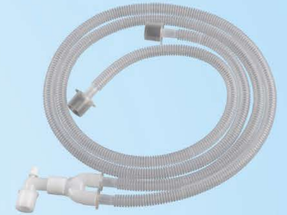
BY-C-I-B1 ● \Phi 10 , 1.2米婴儿型麻醉呼吸管路 1.2m Neonatal, Corrugated ● \Phi 10 , 1.6米婴儿型麻醉呼吸管路 1.6m Neonatal, Corrugated