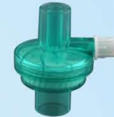
GZ-GL-2 儿童型 pediatric