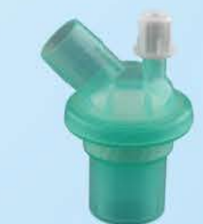
GZ-GL-19 婴儿型 For infants