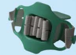
BY-KD-A (加强型) (Reinforced) BY-KD-B (普通型) (Regular)