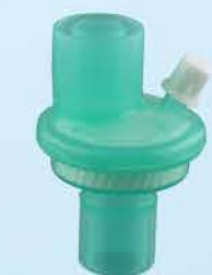
GZ-GL-18 儿童型 pediatric