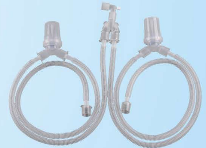
BY-C-I-B3 ● \Phi 10 , 1.2米婴儿波纹管呼吸管路 Neonatal, 1.2m 5 tubes with double water-traps ● 1.6米婴儿波纹管呼吸管路 Neonatal, 1.6m 5 tubes with double water-traps