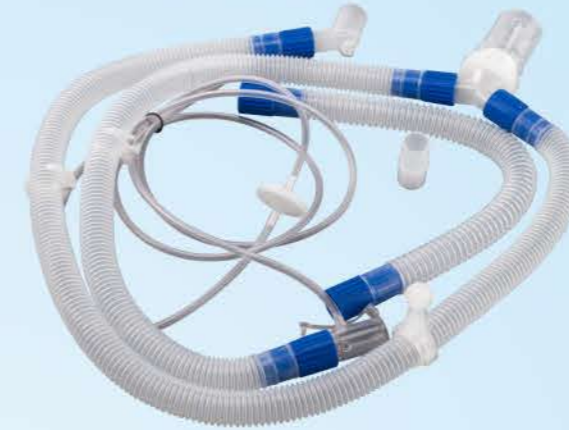
BY-GL-E-1 ● 1.7米成人无创波纹呼吸管路 1.7m Continuous positive airway pressure circuits (Corrugated tube)