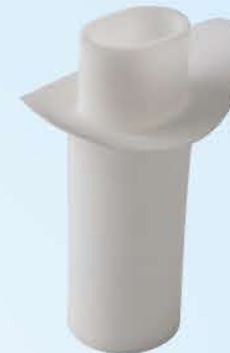
BY-KD-C (成人型) (Adults)

Bite blocks are used to maintain the patient's opening during transoral procedures or examinations, to prevent unintended occlusion, or to facilitate the insertion and fixation of tracheal tubes.