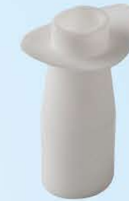
BY-KD-D (儿童型) (Kids)