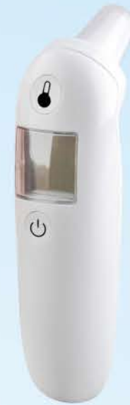
医用红外耳腔式体温计 Medical Infrared Ear Cavity Thermometers BY-TW-A01

显示范围: 32℃~42.9℃ (89.6°F~109.3°F) 工作条件: 环境温度: 10℃~40℃; 相对湿度: ≤85% 大气压力: 70KPa~106KPa; 电源电压: DC: 3V 测量误差: 35.0℃(含35℃)~42.0℃(含42℃)内 ±0.2℃ 32.0℃~35.0℃和42.0℃~42.9℃内 ±0.3℃ 屏幕颜色: 绿色: 35.8℃ ≤ T ≤ 37.5℃ 红色: T > 38.0℃ 不显示颜色: 32℃ ≤ T < 35.8℃ 测量间隔时间: ≥5S 自动关机时间: 60 ± 15S 记忆数据: 10组