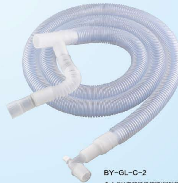
BY-GL-C-2 ● 1.6米麻醉呼吸管路(同轴管) 1.6m Coaxial Circuits ● 1.8米麻醉呼吸管路(同轴管) 1.8m Coaxial Circuits