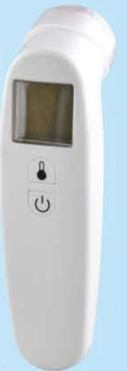
医用红外额温计 Medical Infrared Forehead Thermometer BY-TW-B01

显示范围: 32℃~42.9℃ (89.6°F~109.3°F) 工作条件: 环境温度: 10℃~40℃; 相对湿度: ≤85% 大气压力: 70KPa~106KPa; 电源电压: DC: 3V 测量误差: 35.0℃(含35℃)~42.0℃(含42℃)内 ±0.2℃ 32.0℃~35.0℃和42.0℃~42.9℃内 ±0.3℃ 屏幕颜色: 绿色: 35.8℃ ≤ T ≤ 37.5℃ 红色: T > 38.0℃ 不显示颜色: 32℃ ≤ T < 35.8℃ 测量间隔时间: ≥5S 自动关机时间: 60 ± 15S 记忆数据: 10组