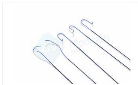
Radiology Angiographic Catheter