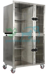
Brand New Cat Condo Available Now YSCC-1201