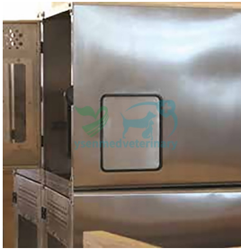
S/S Cat Cage YSCC-1301