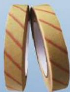
EO Gas Sterilization Indicator Tape