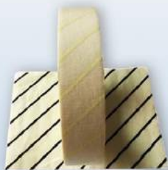
Steam Sterilization Indicator Tape