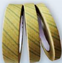
Lead-free Steam Sterilization Indicator Tape