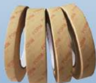
FORM Gas Sterilization Indicator Tape