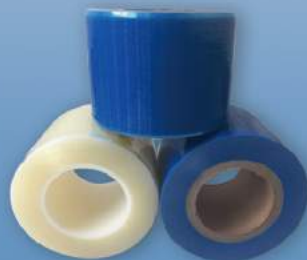
Dental Barrier Film