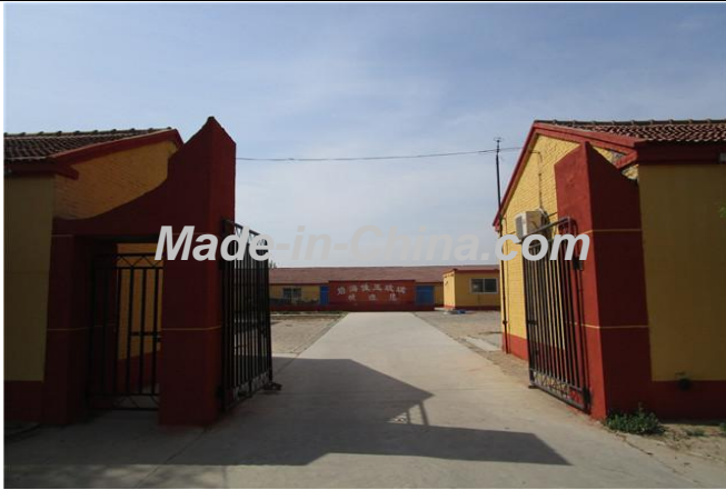
Description: Company Gate