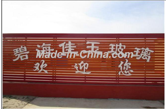
Description: Company Name