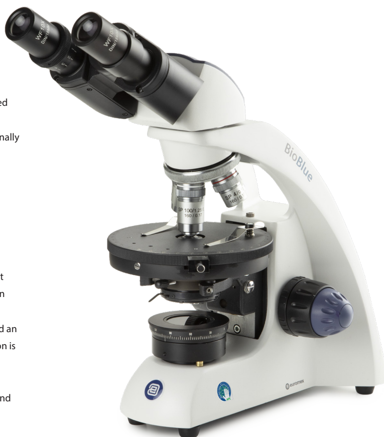
● Polarization model BB.4260-P-HLED

Using the same technology already used extensively throughout the healthcare environment in wall coatings, patient lighting, air pressure stabilization and suction liners, APL prevents the growth of unwanted microbes that can cause degradation, discoloration, staining or odors of the Euromex microscopes