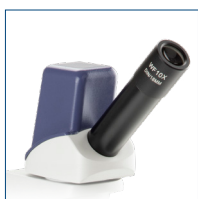
Digital monocular head