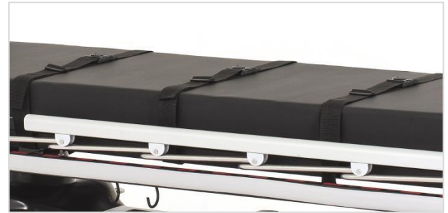
Safety belt (optional)