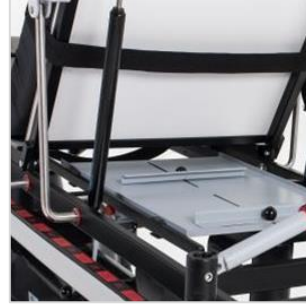
X-ray cassette holder sliding under whole mattress