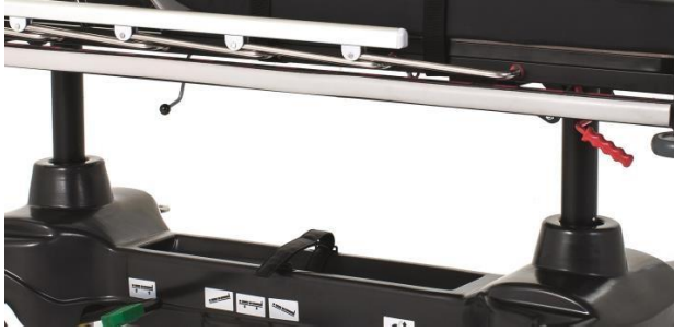
Column construction facilitates the handling with C-arm