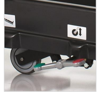
Retractable 5th castor for perfect maneuverability