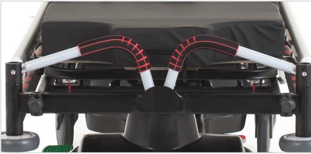
Pushing handles are foldable and removable