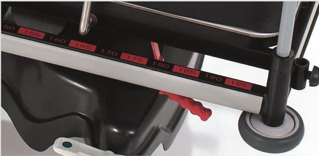
Lengthwise gauges on the stretcher frame enable easy positioning of the cassette