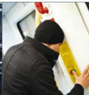
Customised Passenger Voice Terminals