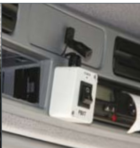
Pump Bay Voice Terminal switch