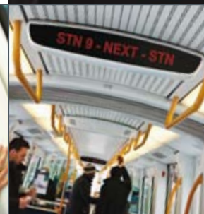
Integrated Passenger Information Systems