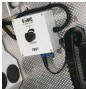
Pump Bay Voice Terminals for Fire & Rescue