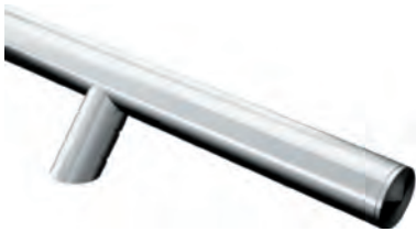
4900_A: Hairline stainless steel 4900_B: Mirror stainless steel