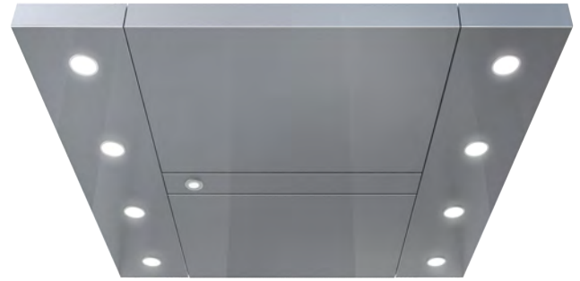
4600L or 4601L