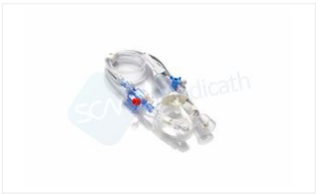
Disposable Pressure Transducers