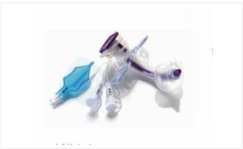
Tracheostomy Tube Kits