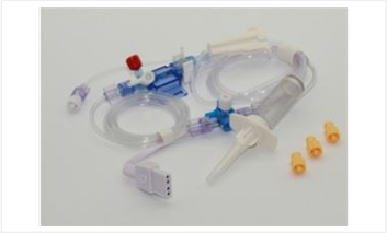
Medical Use Sensor For ICU DPT-01, U Connector for M...