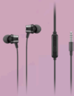
Lenovo Analog In-Ear Headphones Gen II Bulk Package (20pcs) 4XD1T54899