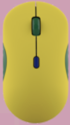
Lenovo 350 Bluetooth Silent Mouse (Fan Edition - Brazil) GY51U71760