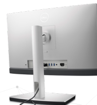
OptiPlex Premier 24 All-in-One Height Adjustable with Flex Bay (ODD Drive) Stand

Raise, tilt, pivot or swivel your All-In-One Plus to enjoy the best view.