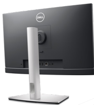
OptiPlex Entry 24 All-in-One Height Adjustable Stand

Collaborate with ease anywhere with this Teams certified wireless headset which offers active noise cancellation and smart sensors that automatically mute and unmute your call.