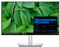
Dell UltraSharp 24 Monitor – U2422H

Take your work to new heights with this 23.8-inch FHD monitor with a wide color coverage. Features ComfortView Plus an always-on built-in low blue light screen, fast connectivity and transfer speeds.