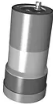
QUADRO Beta detector