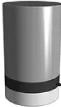
QUADRO Low-background passive shields for beta - detectors