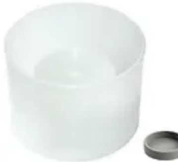
QUADRO Marinelli beaker 1L and cuvette 38ml