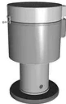
QUADRO Low-background passive shields for gamma - detectors