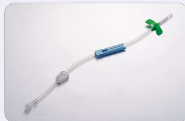
FY0612 A.V. Needle

Size: 18g~28g x 90mm Sterilization: EO Packing: 1pc/Bag, 50pcs/Box, 1000pcs/ctn