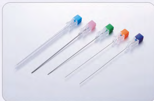
FY0611 Spinal Needle

Size: 18G-25G Packing: 100pcs/bag, 600bags/ctn