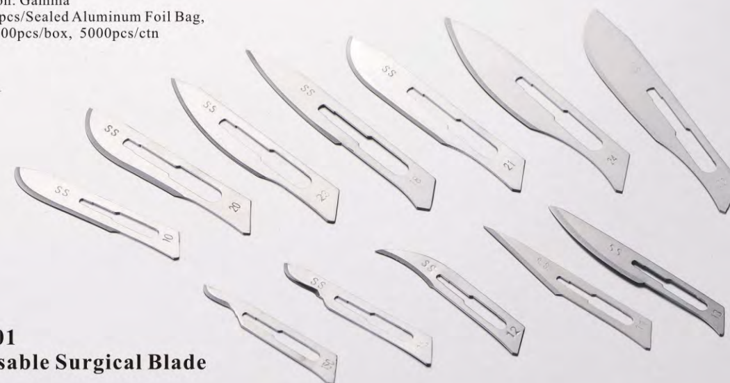
FY0901 Disposable Surgical Blade

All the popular sizes are available in both a carbon or stainless steel sterile Blade shapes #9 to 17 are used in histology units and are all compatible with the associated #3 handles (Blade shape 11 can be also used for gardening with a plastic or metal handle). Blade shapes #18 to 36, #60 and #70 are used for major invasive procedures and are all compatible with the associated #4 handles Sterilization: Gamma Packing: 1pcs/Sealed Aluminum Foil Bag, 100pcs/box, 5000pcs/ctn