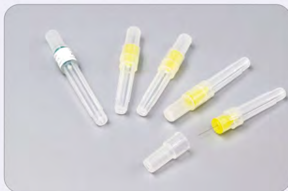
FY050601 Dental Needle

Size: 27g x 38mm 30g x 38mm , etc. Sterilization : EO Packing: 100pcs/Box, 5000pcs/ctn