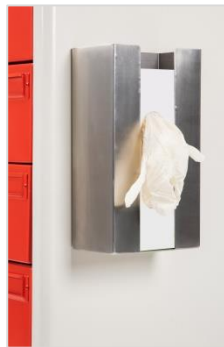
Glove Box Holder