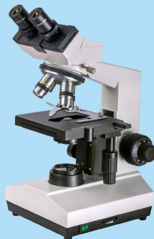
XSZ-PW107BN (Sliding Binocular Microscope)