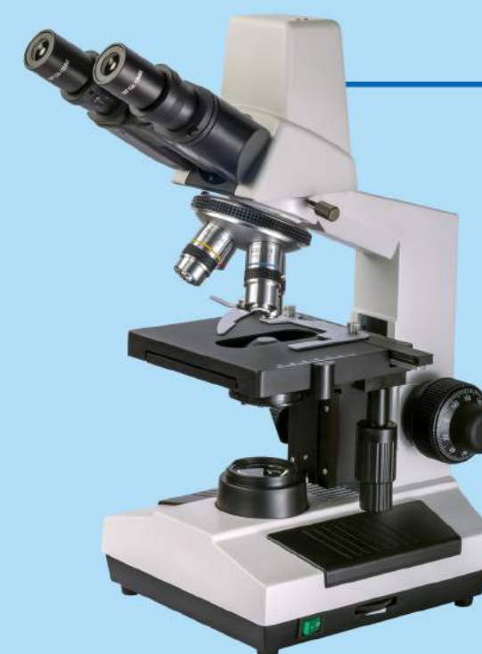
XSZ-PW207D (Digital Microscope)