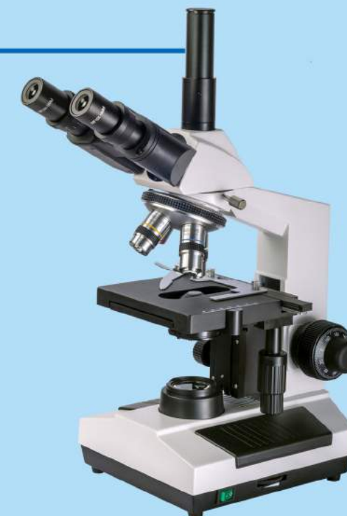
XSZ-PW207T (Seidentopf Trinocular Microscope)