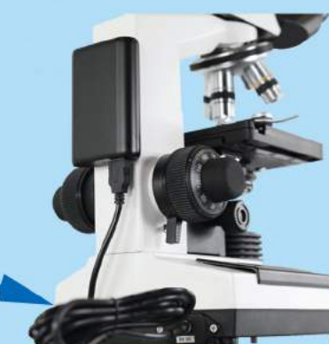
5vDC Base Tray (Optional)