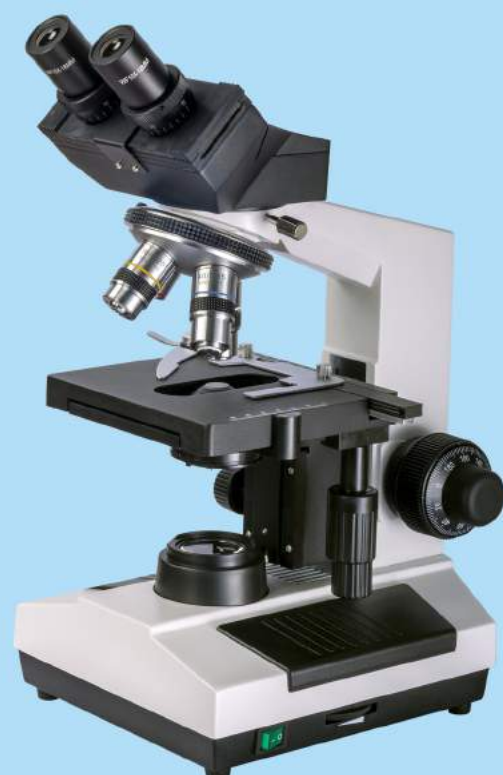
XSZ-PW107 (Sliding Binocular Microscope)