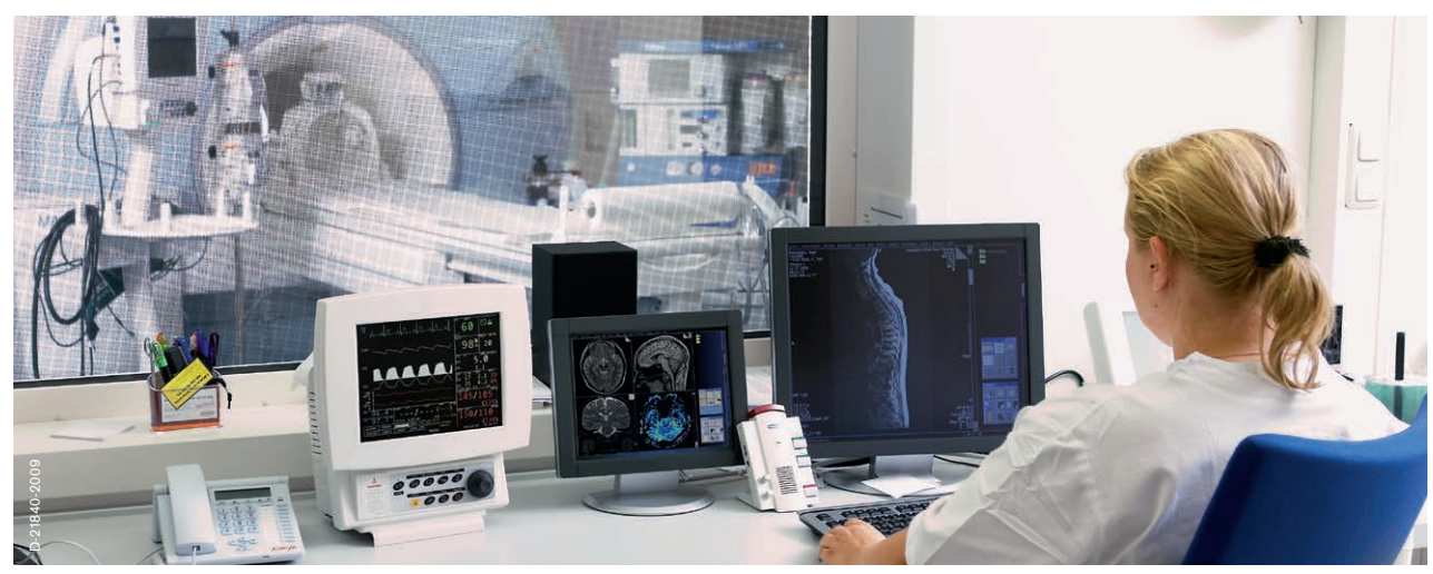
MRI Suite and control room

The cockpit's view from the operator control area. Everything in view and under control.