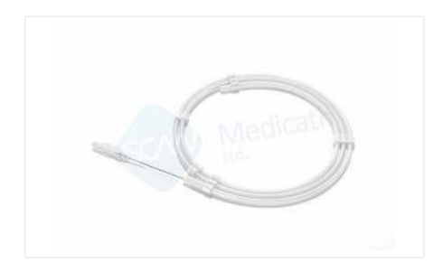
PTCA Balloon Catheter