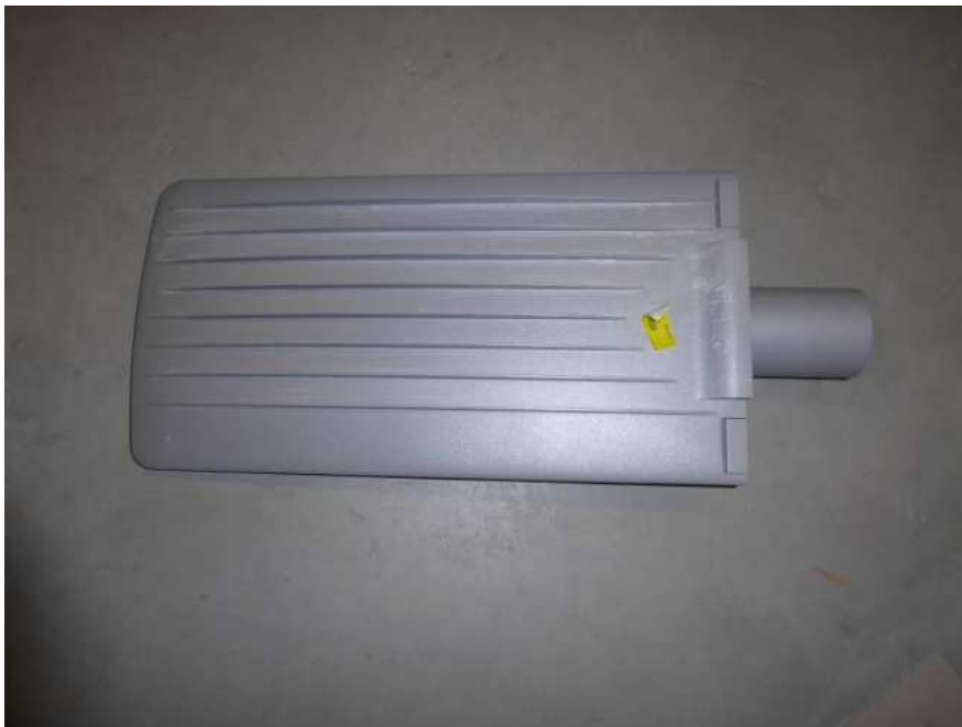
Figures. 1 and 2 – Front side and top side of Little Brother street lighting luminaire.