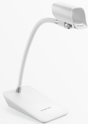
NAVI-FS Fixed Support