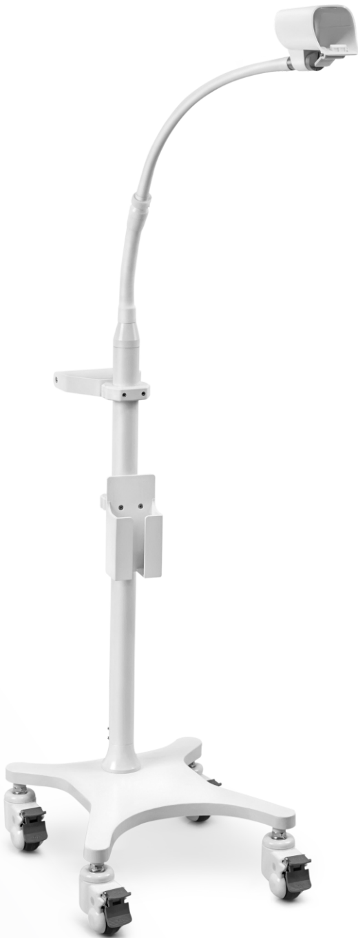
NAVI-MS Mobile Support