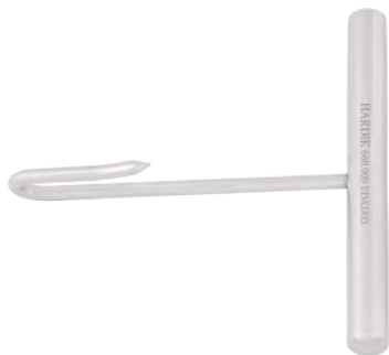
• 660.009 | Gigli Saw Handle Pair