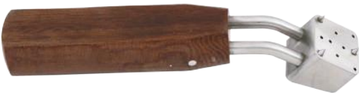
• 656.200 | Parallel Drill Guide 2.0mm