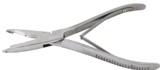
• 660.014 | Universal Wire Cutter / Bender / Pliers