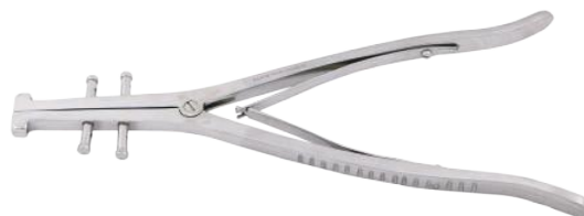
• 660.004 | Wire Tightener/Twister