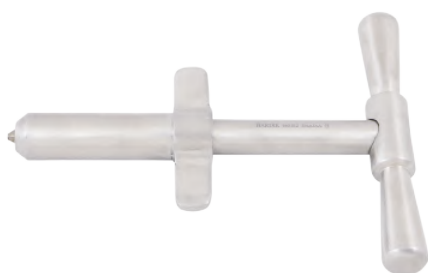
• 660.012 | K Wire Introducer