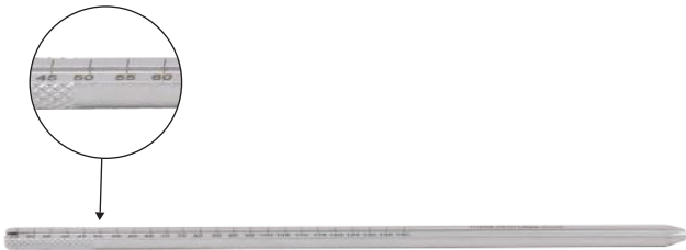
• 670.125 | Direct Measuring Device for 1.25mm Guide Wire