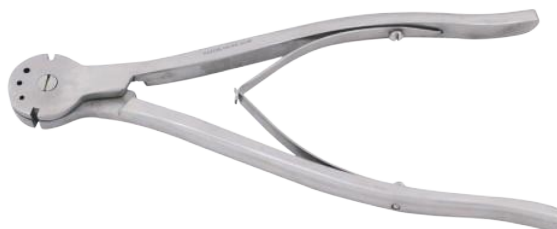
• 660.006 | Wire Cutter Large