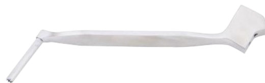
• 660.010 | Triple Drill Guide 2.0mm with 3hole Opposite side 1hole