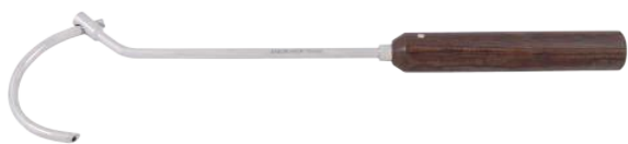
• 660.001 | Wire Passer Small Dia.45mm