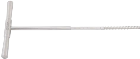
• 658.040 | Tap Cannulated for 4.0mm Screws