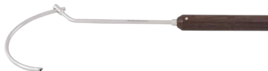
• 660.002 | Wire Passer Large Dia.70mm