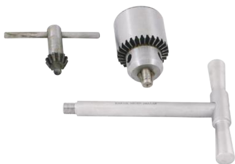
• 660.005 | T Handle With Chuck & Key