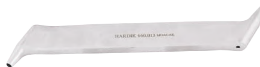
• 660.013 | K Wire Bender Iron