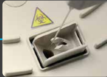
Waterfall probe cleaning