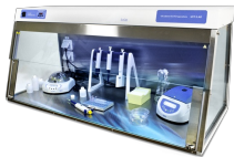
UVT-S-AR BS-040107-AAA DNA/RNA UV-cleaner box

DNA/RNA UV-cleaner box UVT-S-AR is designed for clean operations with DNA samples. UV-cleaner box provide protection against contamination.