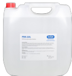
PDS-10L BS-040107-FK DNA/RNA Decontamination Solution 10l DNA/RNA Decontamination Solution.