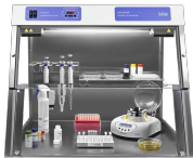
UVC/T-M-AR With built in socket and inlet for power cords DNA/RNA UV-cleaner box

DNA/RNA UV-cleaner box UVC/T-M-AR is designed for clean operations with DNA samples. UV-cleaner box provide protection against contamination.