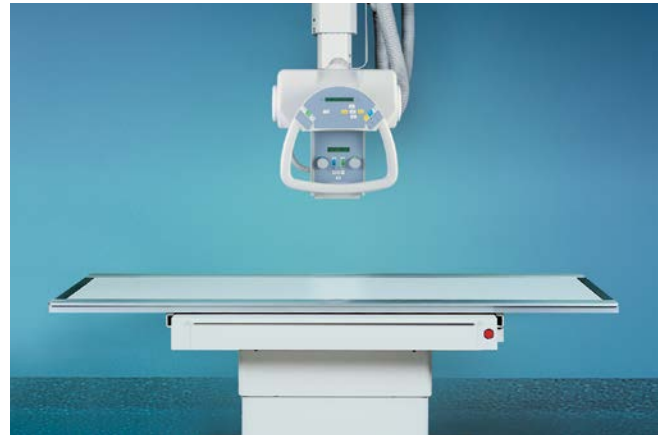
LEM Plus can be typically coupled with a bucky table.

can assure the automatic vertical alignment between the tube and the detector. When equipped with this feature, LEM Plus further increases the ease and accuracy of positioning, speeding up the operator's workflow.