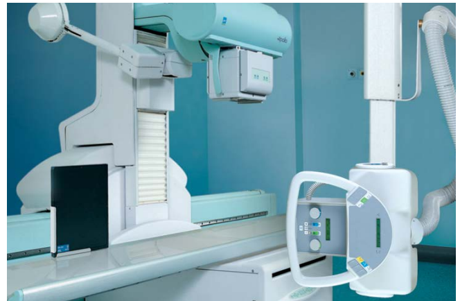
Coupled with remote control tables, LEM Plus allows to execute lateral projections.