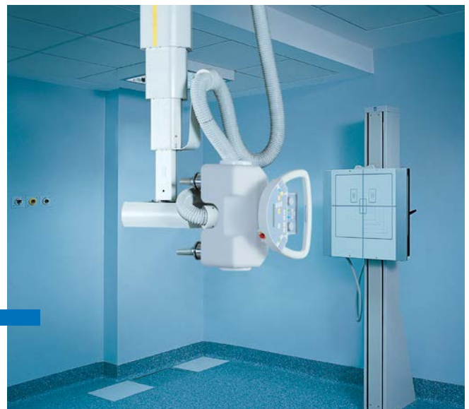
Another typical configuration of LEM Plus is in association with a Chest Stand.

Villa Sistemi Medicali: long-standing experience at the service of our customers