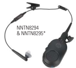
NNTN8294 & NNTN8295*

Bluetooth 2.1 audio is embedded in the radio enabling fast and secure pairing with a variety of Bluetooth accessories. Easy to attach and pair, Motorola Solutions Bluetooth accessories enhance performance and security wherever you work. Officers can talk discreetly undercover, move without wires and use their radio like never before.