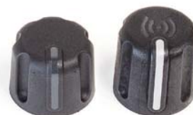
Standard Control Knob RFID Control Knob

◀ Optional colour identification bands for groups with different tasks, coverage areas or shifts