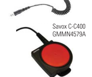
Savox C-C400 GMMN4579A

Complete the solution with the Savox C-C400 com-control unit that enables the use of your two-way radio in hazardous conditions. Designed to be especially robust for the most extreme environments, the extra-large push-to-talk button ensures transmission even when used underneath gear and protective clothing.