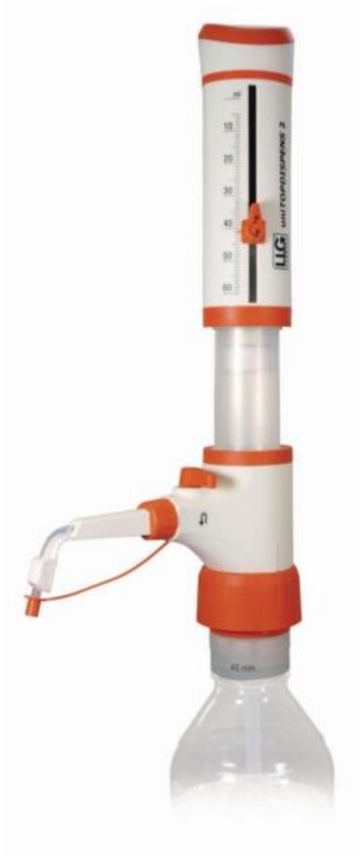
Bottletop dispenser LLG-uniTOPDISPENS 2