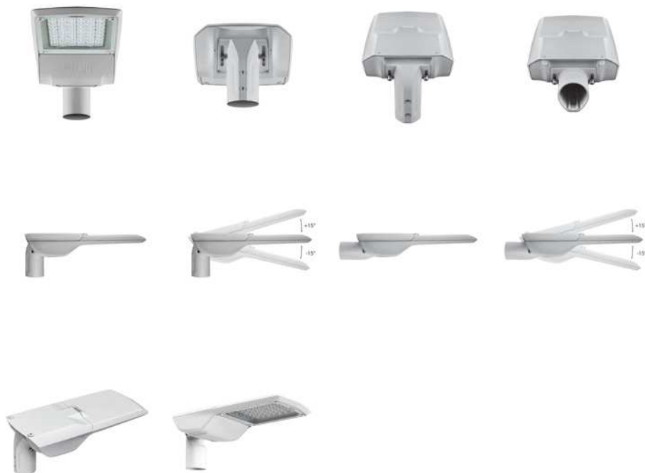
Luminaire with tool-free access to the power supply chamber (on request)