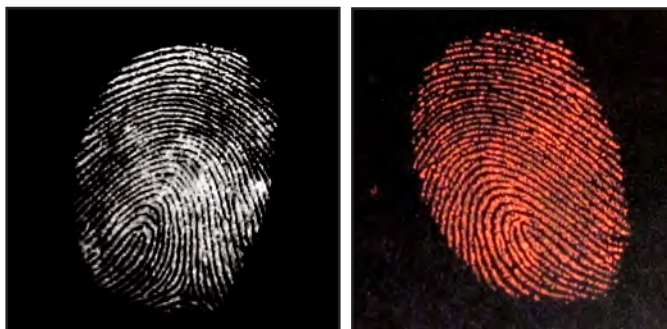
White print on black background. Red print on black background.