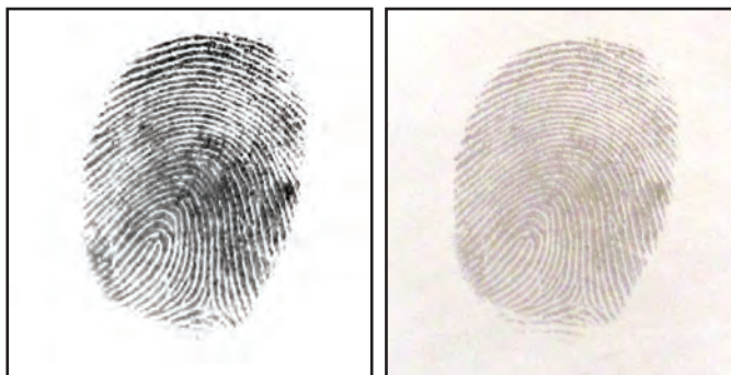
Black print on white background. Gray print on white background.