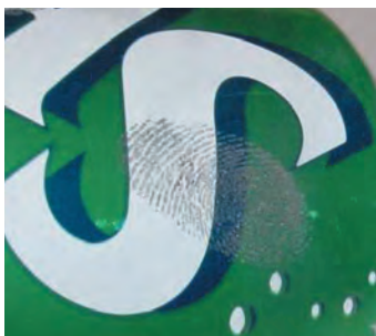
Dual-Use print on multi-colored background.